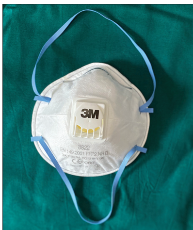
Figure 2: Filtering facepiece respirator

of the respiratory tract and subsequently get expelled via nasal secretions or the mucociliary escalator, inhaled aerosols can penetrate into the depths of the lung and may be deposited in the alveoli. A study comparing the aerosol and surface stability of the SARS-CoV-2 virus showed that the novel coronavirus remained viable in aerosols with only a slight reduction in infectivity at the end of 3 h. [10] As we now know, the SARS-CoV-2 is carried by both droplets and aerosols, and hence, an N-95 is essential for the protection of HCWs exposed to these patients.